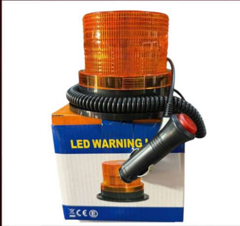
AMBER LIGHT SMALL 12/24 VOLT