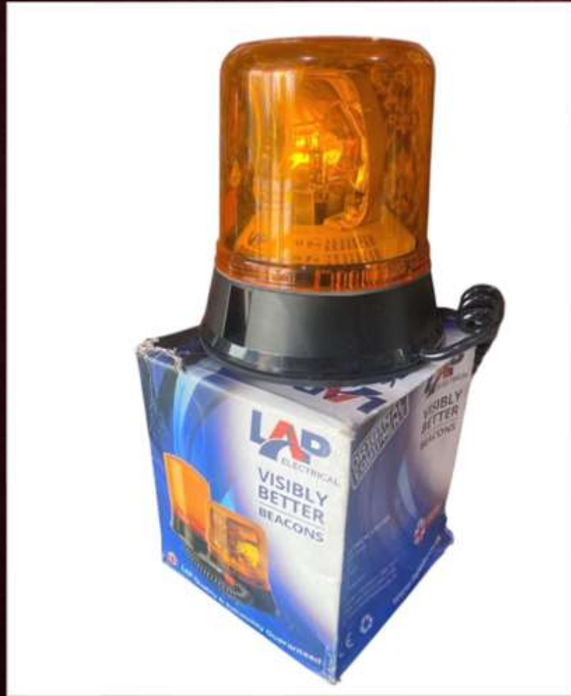
AMBER LIGHT 12/24 VOLT